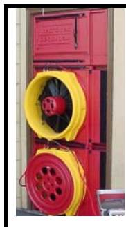
2 fans secure in hard panel