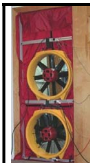
2nd fan for large buildings