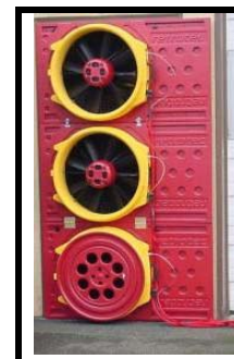
3 fan hard panel