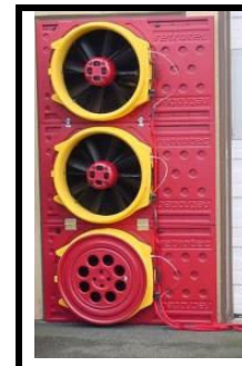
3 fan hard panel