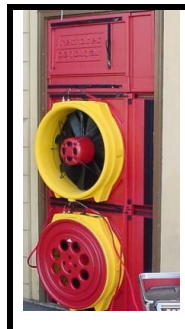
2 fans secure in hard panel